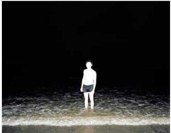
◀ Paper plane inspired on a suicide note written by an inmate in the early 1900s, which was thrown from a prison cell window. ▲▲ Untitled. ▲ Man Leaves a 1904 Page Suicide Note and Then Shoots Himself as Part of a Philosophical Exploration.